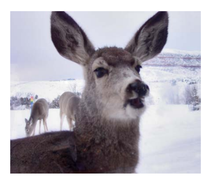
Merry March is here. Happy St. Patrick's Day!

March comes in like a lamb. We do not have sheep, but we do have deer, everywhere. So our pictures this month are of our deer family that come to eat every day.